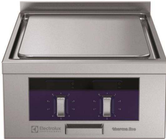
589004 (MCLBABEOAO) Electric Solid Top, 2 zones, ecoTop coating, one-side operated with backsplash